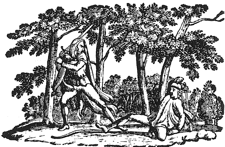
Illustration Accompanying Ballad Guy of Gisborne, in First Edition of Ritson's Work, 1795, Vol. 1, page 114. No. 674, Edition [1].

Contents: Vol. 1: Life of Robin Hood, p. iii-xii — Notes and illustrations, p. xiv-cxviii — Part the first. 1. A lytell geste of Robyn Hode, p. 1-80 — 2. Robin Hood and the potter, p. 81-96 — 3. Robin Hood and the beggar, II, p. 97-113 — 4. Robin Hood and Guy of Gisborne, p. 114-125 — 5. A true tale of Robin Hood, by Martin Parker, p. 126-148 — Glossary, p. 149-167.