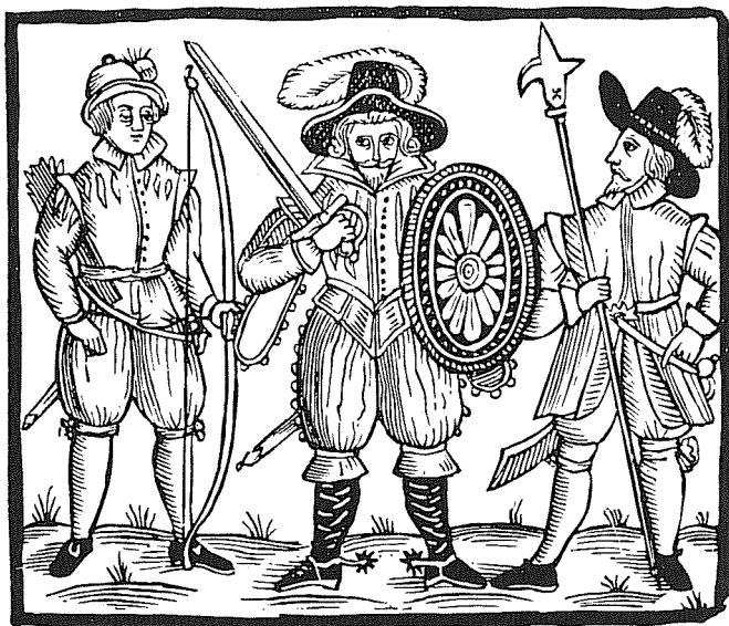
From Jolly Pinder of Wakefield, in Ballad Society's Reprint of the Roxburghe Ballads. No. 406.