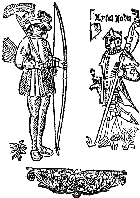
Title Page of Second Edition of the Geste, First to Include the Newe Playe, 1561-1569. No. 528.